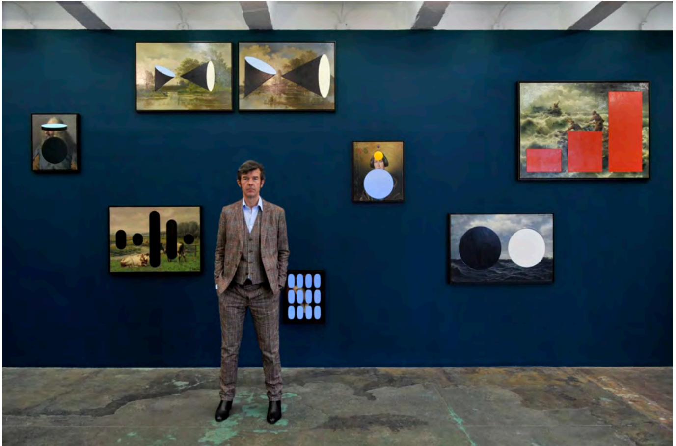
Stefan Sagmeister Beautiful Numbers (installation view) Thomas Erben Gallery, April - May 2021

Stefan Sagmeister received his MFA from the University of Applied Arts in Vienna (MAK) and, as a Fulbright Scholar, a master's degree from Pratt Institute in New York.